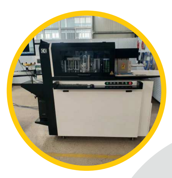
Letter Bending Machine