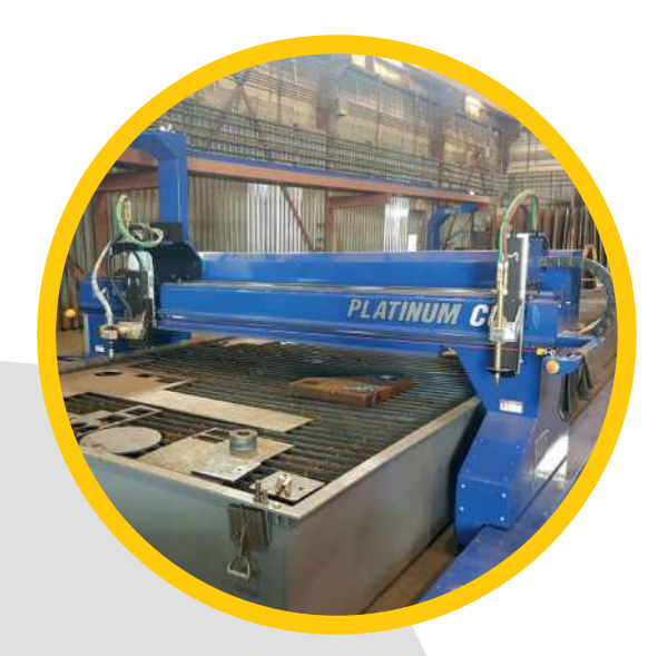
Fiber Laser Cutting Machine