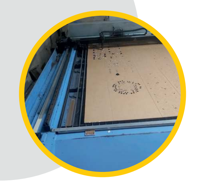
Acrylic Laser Cutting Machine