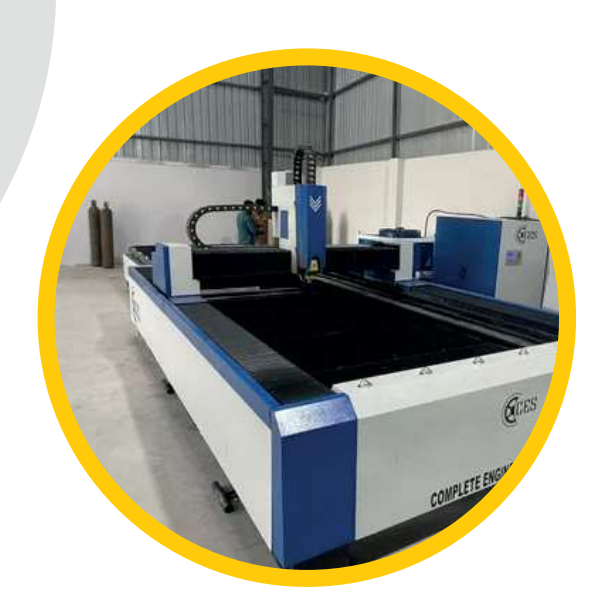
CNC Cutting Machine