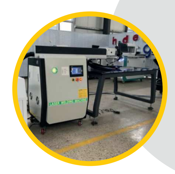
SS Letter Welding Machine